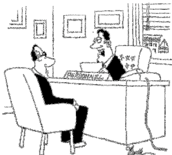
“Sorry, we just filled our ‘Financial Analyst’ position, but we do have an opening in ‘Sacrificial Lambs.’”

Are Digital Devices Dumbing Us Down?.....Page 4